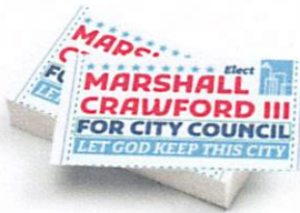
Standard Business Cards ►