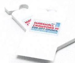
Door Hangers ►

Any images featuring your own design are visible only to you.